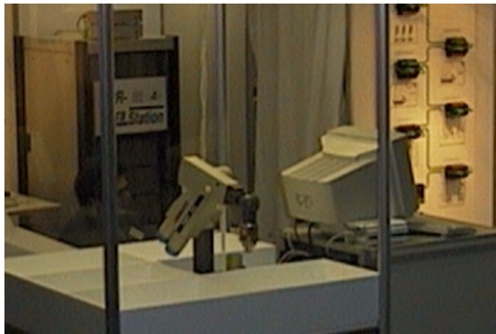
Figure 5: The real robot work cell presented at the trade fair SPS/IPC/Drives in Nürnberg, 1997

The motion planner itself runs on the IPR-ParaStation, a PC-based workstation cluster [Wurl197a]. It only needs the CAD model and the start and goal configurations and an address to which it sends the solution path. In our scenario, a solution is successfully found in less than one second. The path is then sent to the robot simulation tool for visualization and is sent to the robot control unit for execution. For an optimal path execution the trajectory has been smoothed by a spline interpolation in the C-space, which is a special motion skill on the robot control unit.